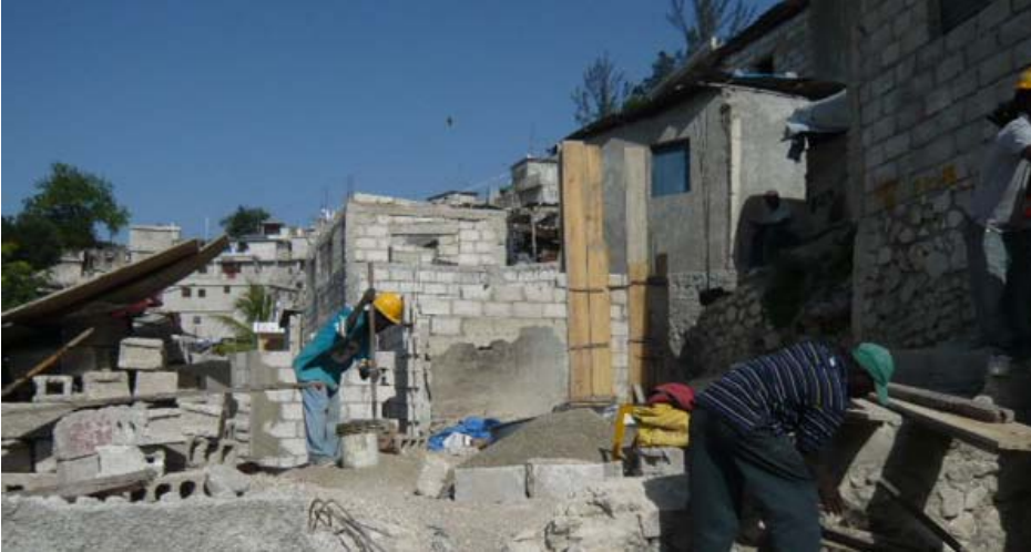
A home repair underway using the training and building guidelines taught by Build Change, June 22, 2011.

We encourage donors, architects and engineers in Canada to get to know this organization's work and support it. 15