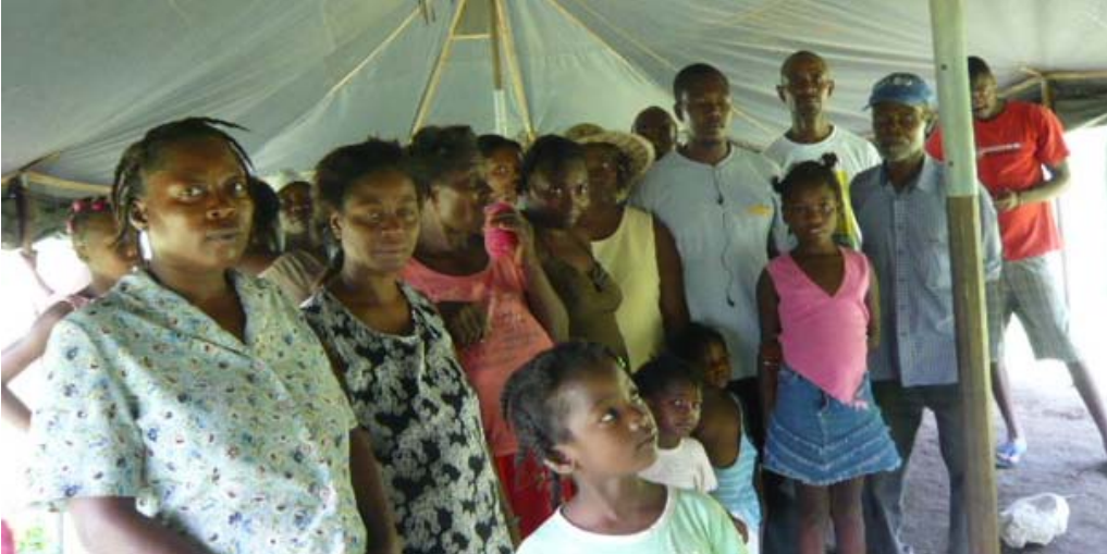
Residents of Camp Bolivar are angry that so little housing is being built.

We attended a press conference that dozens of residents of Camp Django (app. 100 families in Delmas 17, central Port-au-Prince) held at the office of the Bureau des avocats internationaux on June 28 to denounce threats to dismantle their camp coming from the office of the mayor of Delmas (more on the threats of forced dislocations from camps later in this report).