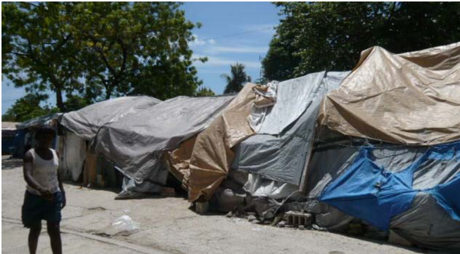
One of the 1,000 displaced persons camps in the earthquake zone.

Although efforts to develop a shelter and resettlement policy began in May 2010, it is still being debated because there is no government interlocutor at a technical or policy level who can sign off on an option. p 9